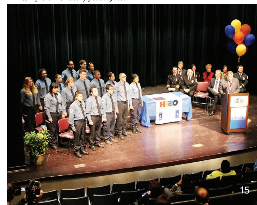
Spring 2013 EMS Academy graduating class

are currently working at Regions and United Hospital, working with ambulance companies such as Allina, HealthEast, and the Saint Paul Fire operated Basic Life Support Transport Service. Additionally, some graduates are employed by the Saint Paul Parks and Recreation Department to promote public safety in the parks and offer free CPR training as certified CPR Instructors. Of EMS Academy graduates surveyed in 2013, 94% of graduates report being currently employed, 63% are working in an EMS related field, and alumni report an average income increase of roughly 40%.