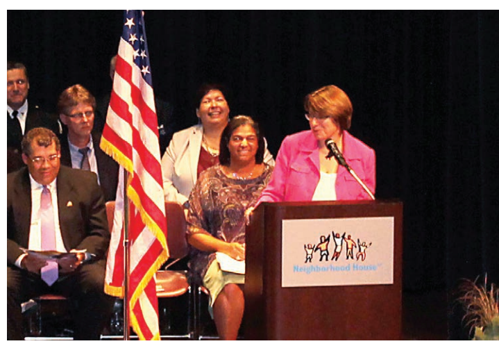
U.S. Senator Amy Klobuchar presenting at the Summer EMS Academy graduation ceremony