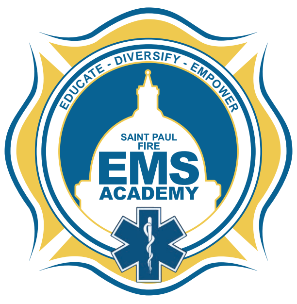
New EMS Academy logo

The EMS (Emergency Medical Services) Academy is an intensive 240-hour Emergency Medical Technician (EMT) certification and firefighter awareness program. The goal of the EMS Academy is to build an EMS workforce that is reflective of the diverse population of Saint Paul. Recruitment is targeted to low-income Saint Paul youth of diverse ethnicities and linguistic ability.