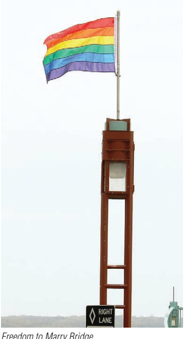
Freedom to Marry Bridge

In addition to the extensive inclusion efforts already made by the city, several new steps toward inclusion were taken in 2013. The city appointed a mayoral department liaison to the LGBT community, cel-